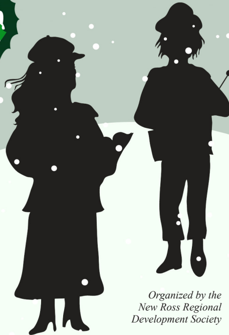
Organized by the New Ross Regional Development Society